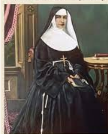
Saint Marianne Cope Beloved Mother of Outcasts 1838-1918 Memorial Feast - 23 January